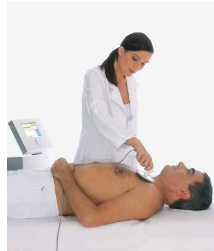
GB 2018-05. Errors excepted. Technical data subject to change without notice.

DEEP OSCILLATION can help quickly and effectively!