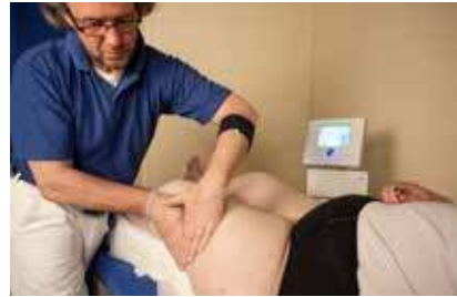
Application example: gentle yet powerful, deep oscillation decongestion in lipoedema.

For questions and further information about deep oscillation therapy I am at your disposal.