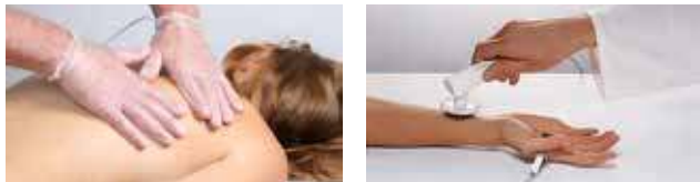
The therapy is applied either with gloves or a special applicator

For the treatment, the patient holds a titanium neutral element loosely between the fingers. The pleasant therapy effect of deep oscillation is created beneath special gloves of the therapist or a specially designed hand applicator (second contact) circling over the tissue.